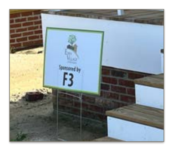
"Soon, this village will come alive and have real impact." - LETC